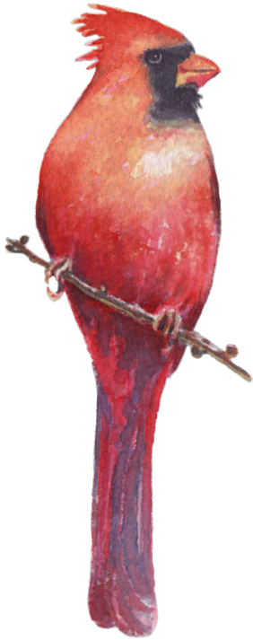
WEEK ONE: CARDINAL OF HOPE

This page includes the bird ornaments for "The Dawn Chorus: An Advent Devotional on the Wonders of Birds." We recommend printing this page on card stock. Then, cut out the appropriate bird for each week of Advent, punch a hole in the top of the ornament, decorate it with live greens and twigs, and put it up on your Christmas tree (or in some other prominent spot).