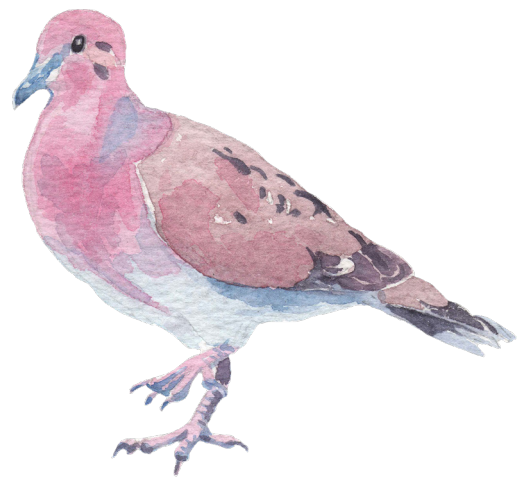
CHRISTMAS EVE: MOURNING DOVE