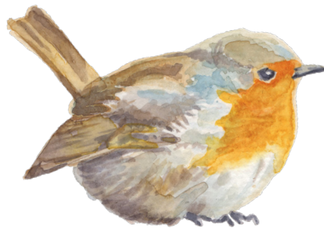
WEEK TWO: BLUEBIRD OF PEACE