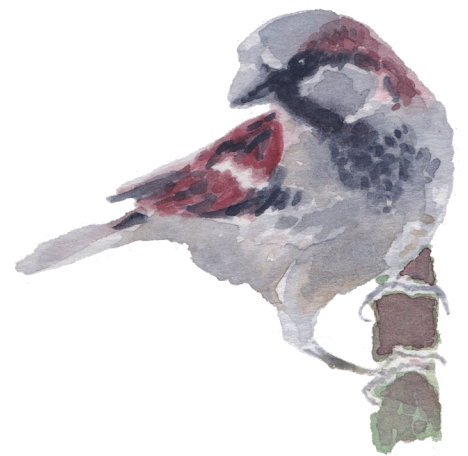
WEEK THREE: SPARROW OF JOY