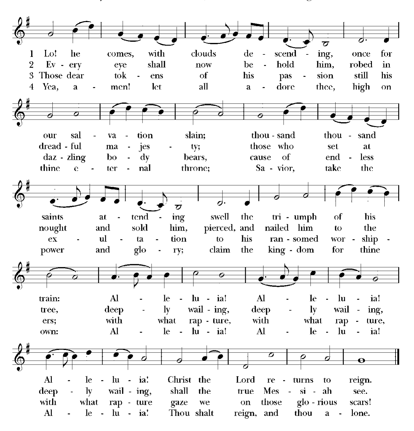
Hymn #57 Lo! He comes, with clouds descending