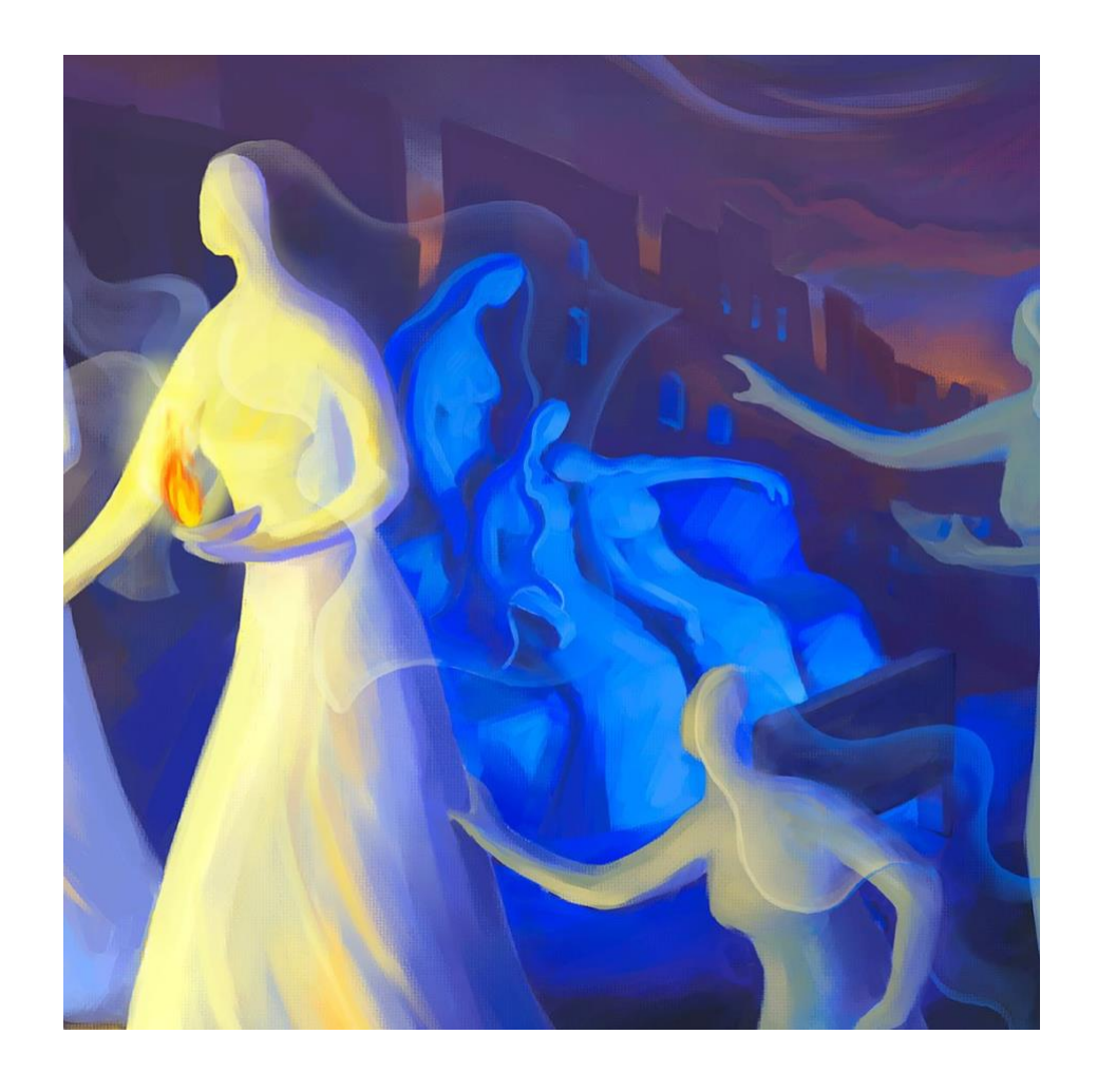
But at midnight there was a shout, 'Look! Here is the bridegroom! Come out to meet him.' all those bridesmaids got up and trimmed their lamps.

Recorded Service for weekend of November 7-8, 2020