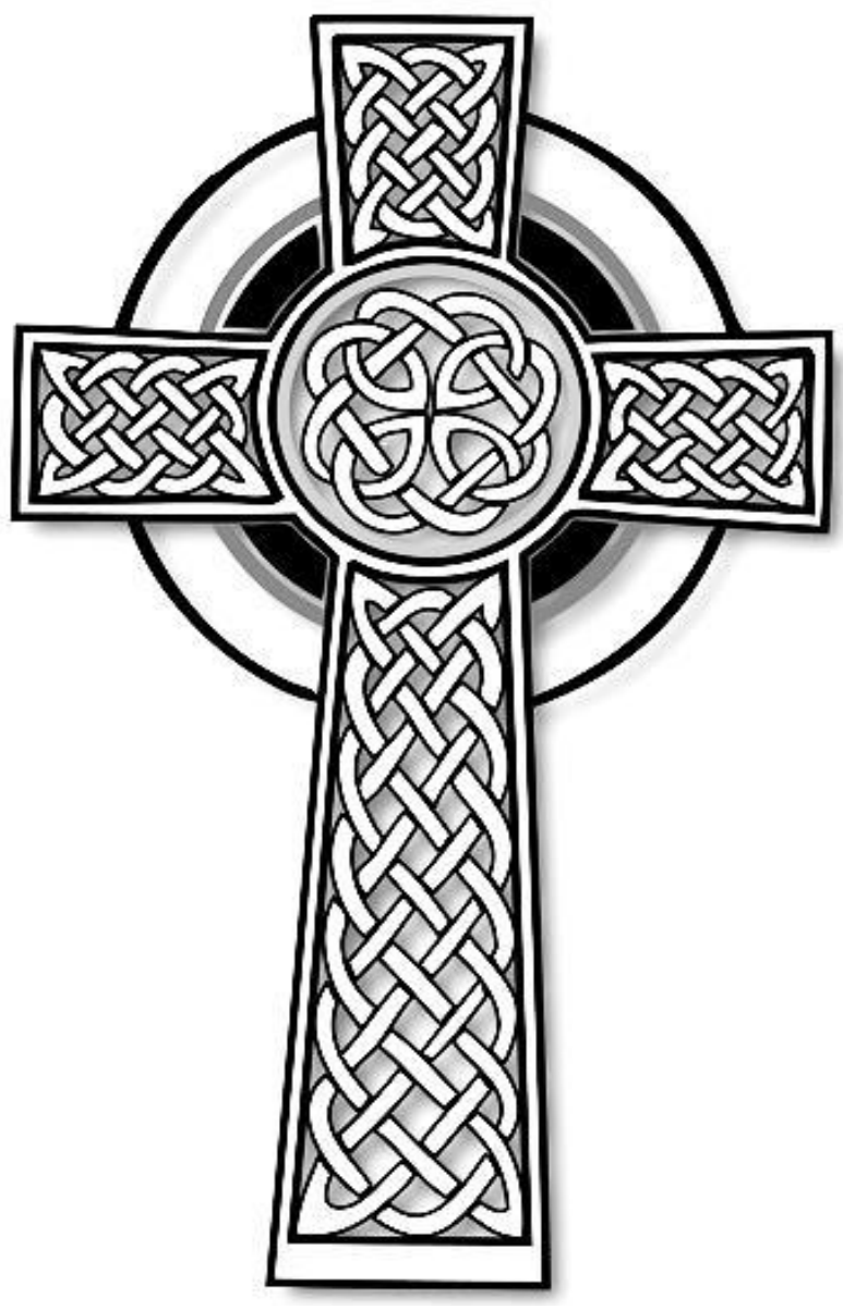
July 19, 2020 7th Sunday of Pentecost (Proper 11) VIRTUAL SERVICE