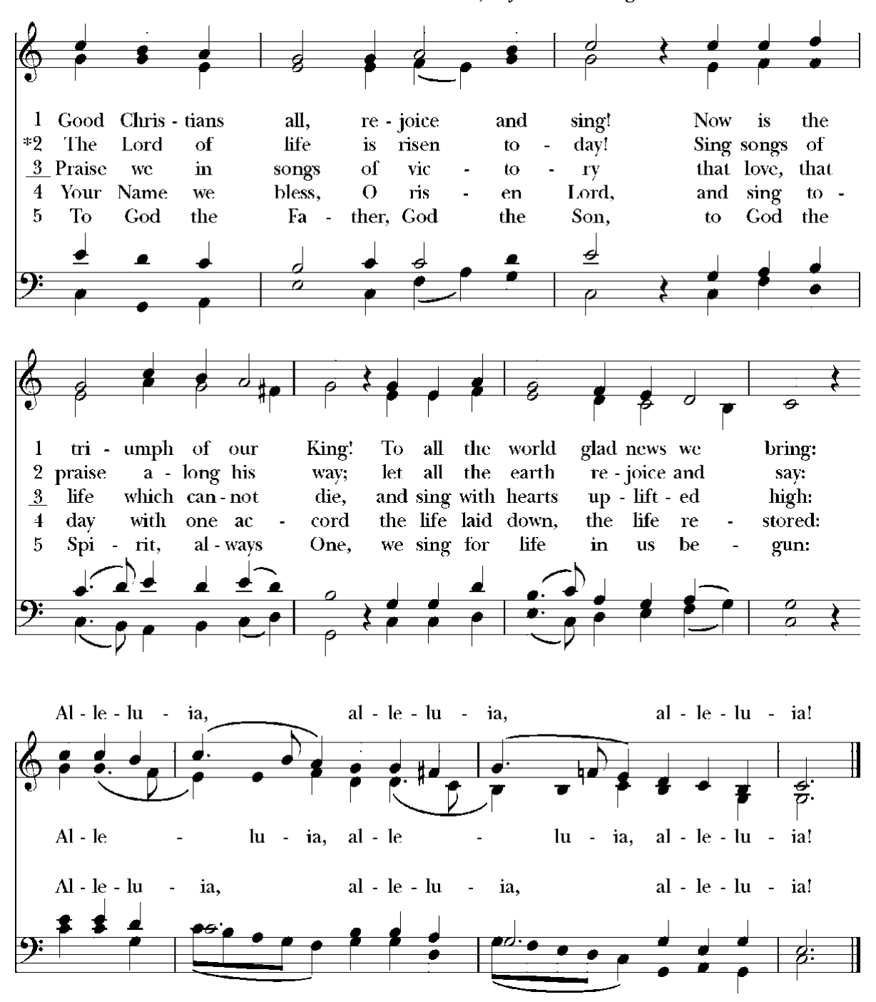
THE CLOSING HYMN #205 Good Christians all, rejoice and sing!